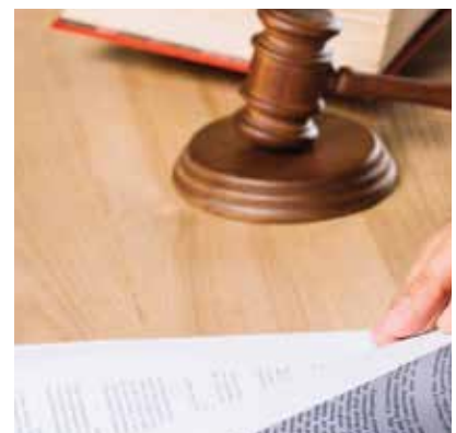
Tax Litigation: The Saga Continues