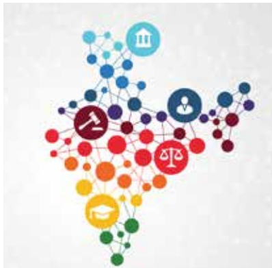
Taxand - Asia regulatory updates