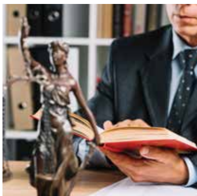
Important Considerations under Indian Export Control Regulations