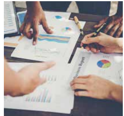
Investigation under GST Law and Criminal Proceedings