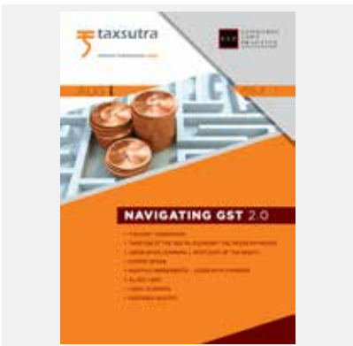
Navigating GST in 2021