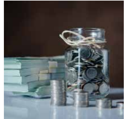
Key income tax concerns surrounding the Insolvency and Bankruptcy Code, 2016