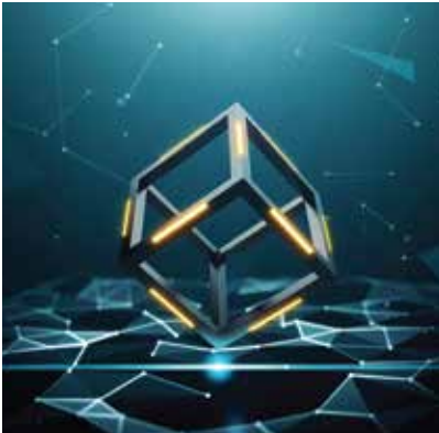
Equalization Levy: The Ambiguity Continues To Exist

ELP's taxation team constantly endeavours to analyze changes in the regulatory space and its implication on business via its publications and webinars. Opinions and perspectives of our tax team are often sought by industry associations, trade bodies and media.