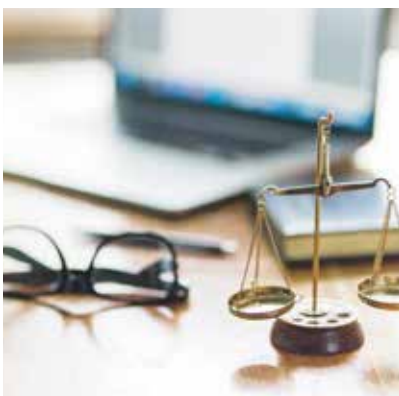
Compliance under Legal Metrology – Issues and Challenges