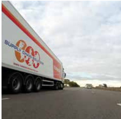
India: Untangling the Supply Chain