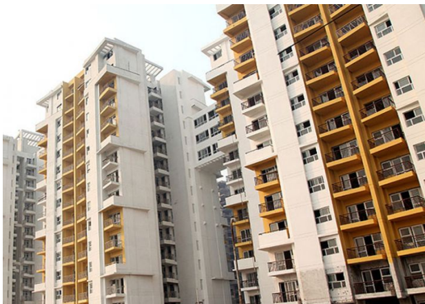
Representational pic - With no GST breather, ready-to-move-in flats to cost more